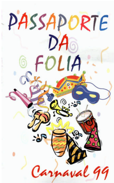
Passport for Fun Carnival 99